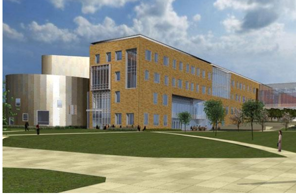
Figure 2: Northeast Elevation

current campus buildings. The North elevation, shown in Figure 1, is primarily comprised of brick veneer with certain areas being backed up by CMU. Also shown is a curtain wall system made up of aluminum framing with insulating glass. The Northeast elevation showing the Proscenium Theater on the left, in Figure 2, is made up of stainless steel wall panels, backed up with concrete and steel studs. The remaining